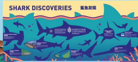
Shark facts shared by researchers from James Cook University Singapore

Partnering with researchers – James Cook University Singapore