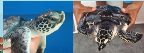
Louie the Green Sea Turtle

Rescued Sea Turtles Louie And Hawke Return To The Wild